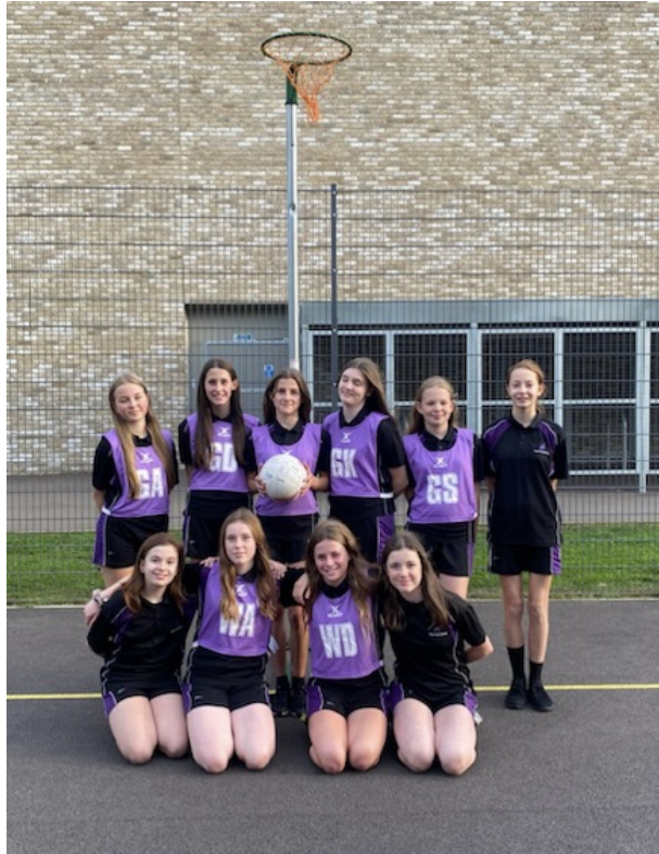
Team of the week: Year 8 Girls Netball Team

On Wednesday the 16th of November we will be showing a screening of “COP27: Inspiring positive climate action in your school with Konnie Huq” in the hall at 11-11:30am. During this virtual broadcast for schools, pupils will learn about COP27, the 27th annual, global climate conference, held by world leaders this November, and the steps we can all take to tackle the climate crisis.