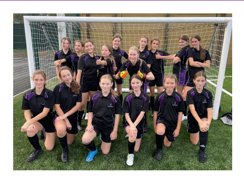
Team of the week: Year 7 & 8 Girls Football Team